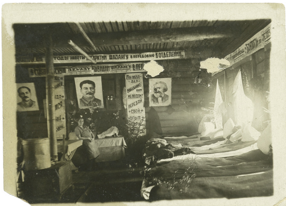
If only someone had bothered to look: accommodation in the Gulag in 1936