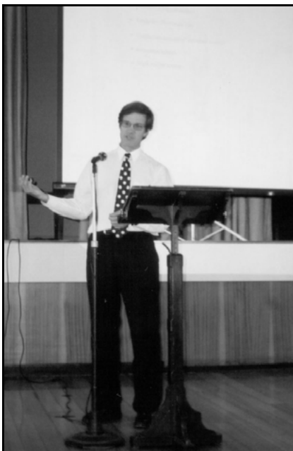
Mike Nahan speaking at the CCWS Liberal conference

The refugee debate is not only driving a wedge between the masses and the elites—something which augurs poorly for the quality of democracy and debate—but has