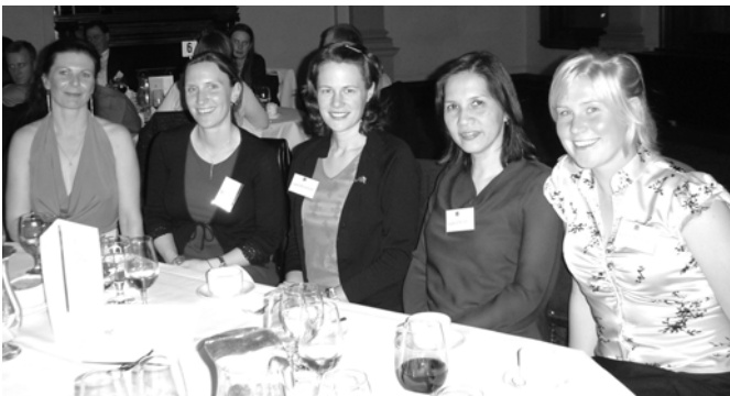
A group of PhD students from the University of Melbourne