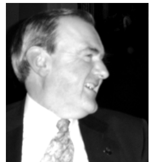
The Hon David Kemp, then Minister for the Environment