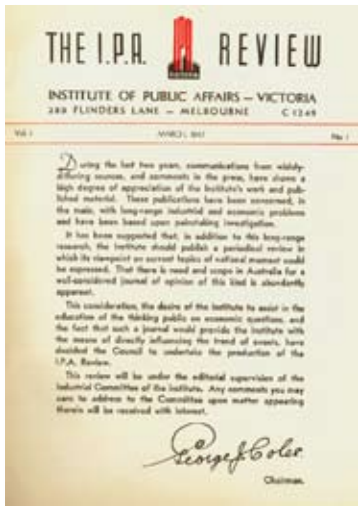
The first page of the IPA Review March 1947