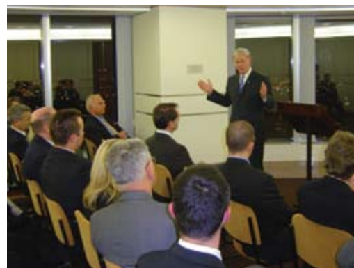
Andrew Robb at an IPA Melbourne Dialogue

Lynton Crosby , former Federal Director of the Liberal Party, addressed IPA members and guests at the offices of Minter Ellison Lawyers on the role of the media in the 2005 British election as part of the IPA's series on 'Media and Politics'.