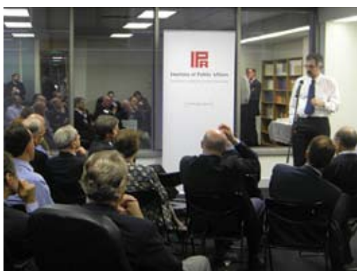
Daniel Pipes talks at the IPA offices