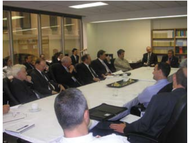
Federal Minister Ian Macfarlane addresses the Energy Forum

For more information about the IPA's energy project visit: http://www.ipa.org.au/units/energy.html