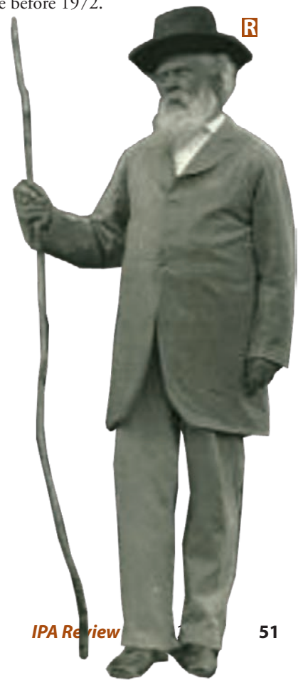
Sir Henry Parkes at Faulconbridge, NSW, [1888-?]

Political ideas are not taken seriously in this country because Australia's march towards liberal democracy is assumed to have been inevitable. Those ideas that are taken seriously by historians and political scientists are usually just reheated mid-century progressivism. Colonial Ambition demonstrates that politics in Australia started a long time before 1972.