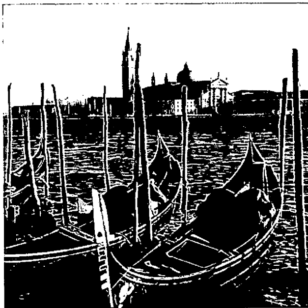
A view across the Grand Canal to San Giorgio Maggiore, Venice, Italy

Now, if we draw a map of Italy in 1993 according to wealth, we will find that communities with many choral societies are also more advanced economically. I originally thought that these fortunate communities had more choral