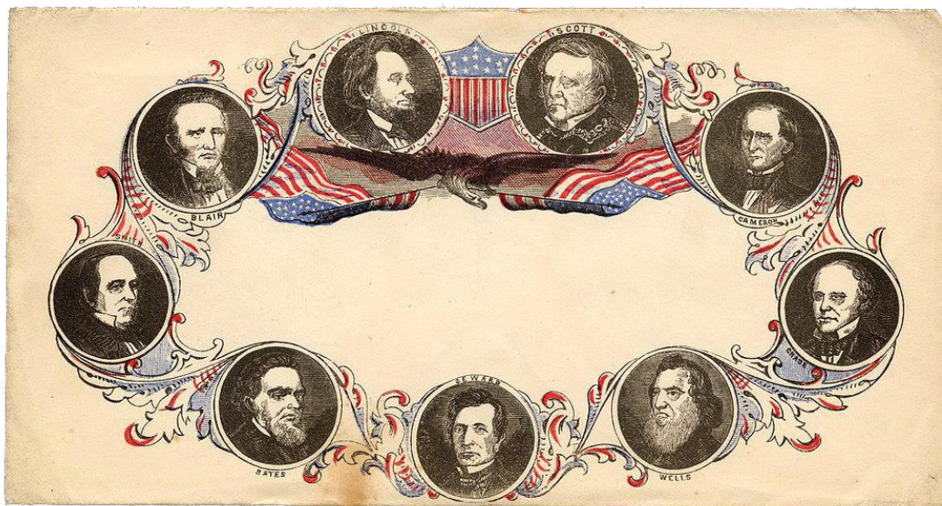
Civil War-era commemorative envelope of Abraham Lincoln's cabinet.

sages to the South and their own constituencies. The closing call to the 'mystic chords of memory' was drawn from one of Seward's suggestions. That Delaware, Kentucky, Maryland, Missouri, and West Virginia, all slave states, all remained within the Union was a positive outcome of this diplomacy.