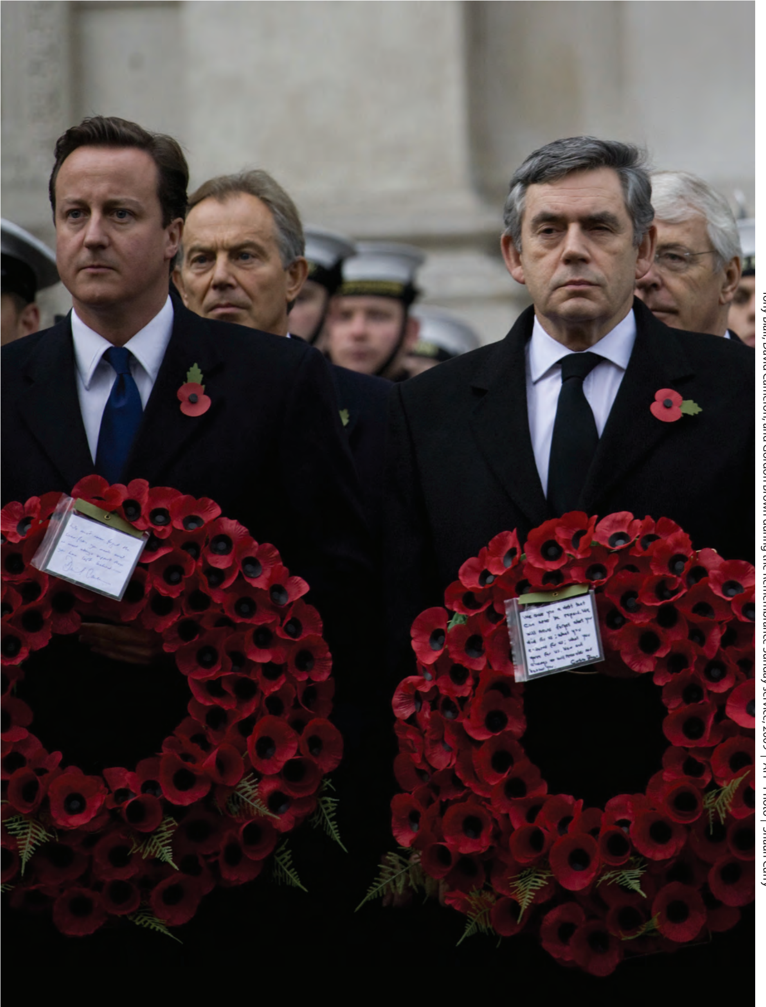
Only Blair, David Cameron, and Gordon Brown during the Remembrance Day ceremony, 2002